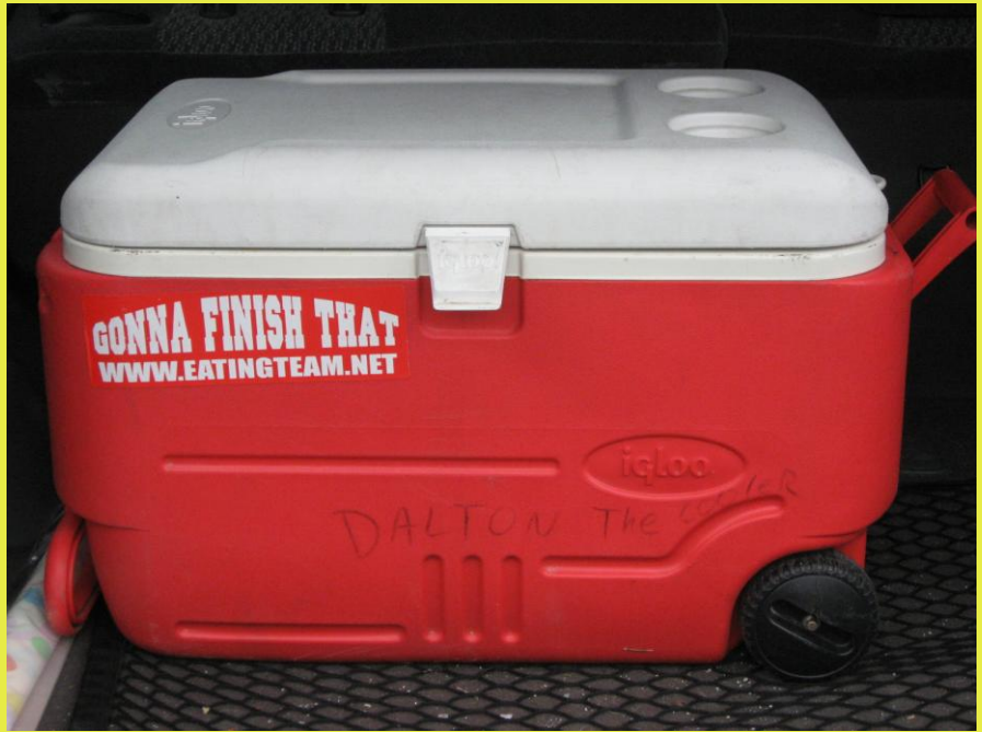
Dalton the cooler was packed full.