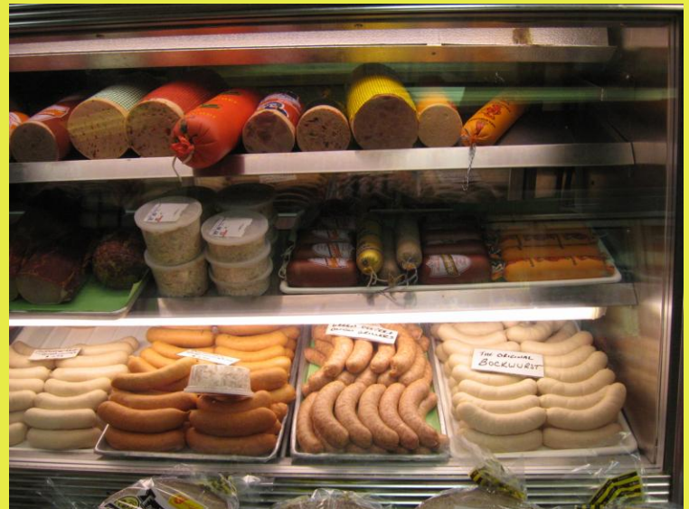
Some of the best meat cases we have ever laid our eyes on.