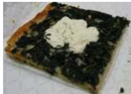
MANY OPTIONS FOR TOMATO PIE