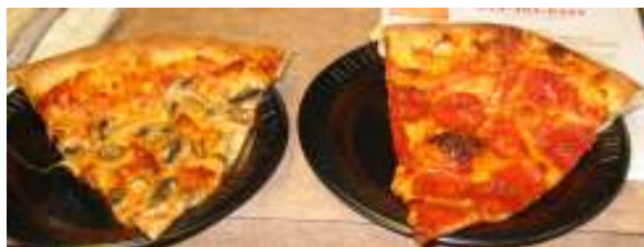
VERY GOOD THIN CRUST PIZZA

THIS IS A GREAT FIND IN THE AREA. THIS IS MORE OF AN ITALIAN MARKET TYPE PLACE WITH TONS OF FRESH BAKED BREADS AND BAKERY. THEIR PIZZA AND HOAGIES ARE TOP QUALITY AND SOME OF THE BEST WE HAVE HAD IN BUCKS OR MONTGOMERY COUNTY. INSTEAD OF TRAVELING ALL THE WAY DOWN THE ITALIAN MARKET IN SOUTH PHILLY, YOU CAN JUST STOP IN HERE AND GET YOUR BREADS AND CHEESES AS WELL. BELOW ARE SOME PICS OF SOME OF THE FOOD WE SAMPLED TODAY